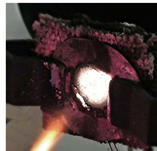
Fig. 3 - View of carbonized surface of an experimental vulcanizate sample (coke layer) under the flame exposure